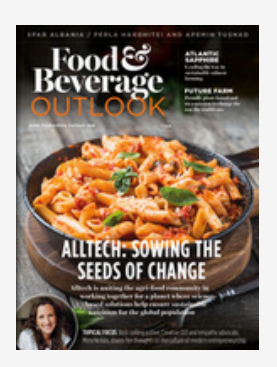
Food & Beverage Outlook