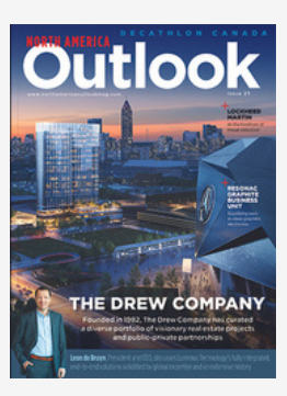
North America Outlook