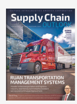
Supply Chain Outlook

We have two primary reasons for entering into event media partnerships. First: Our readers are interested in exhibiting and/or attending the events that we partner with. Second: Our Editorial Projects Team identifies and sources corporate success stories and potential interviews for upcoming issues of our business titles.